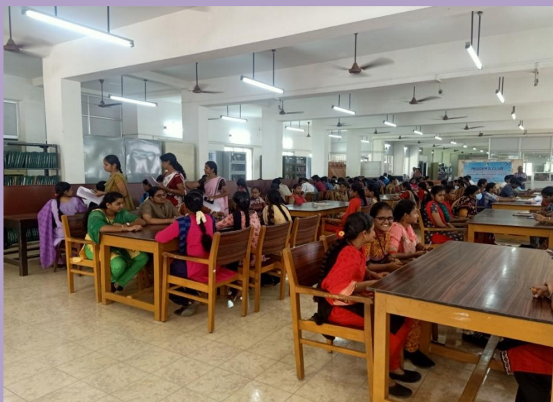
READERS CLUB: G.K. Competition on 12.04.2022